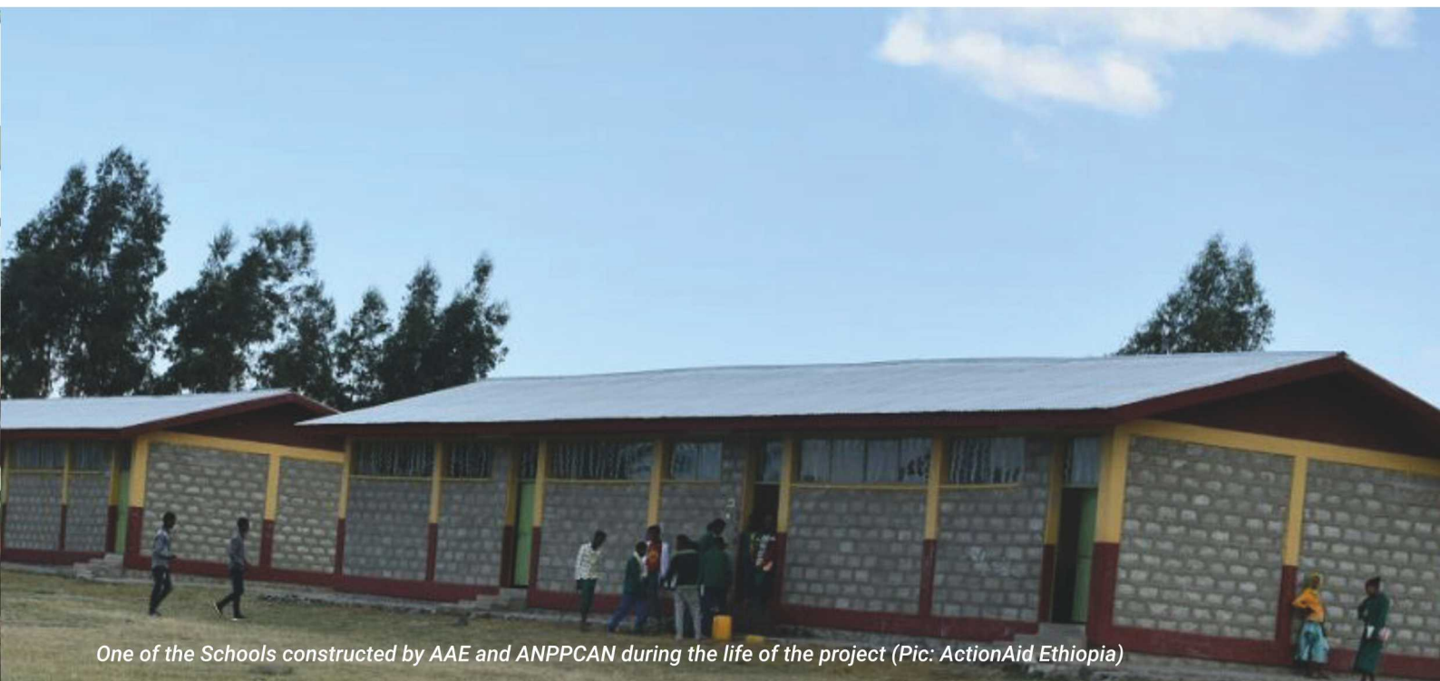
One of the Schools constructed by AAE and ANPPCAN during the life of the project

In Garar Jarso and Fitcha area development programme, ActionAid allocated and utilized a total of 50 million Birr for the implementation of the Garar Jarso Integrated Child/Women-focused Development Programme that was fully implemented by ANPPCAN. The programme included child protection and participation, education, food security and emergency response, women development, primary health care and HIV/AIDS.