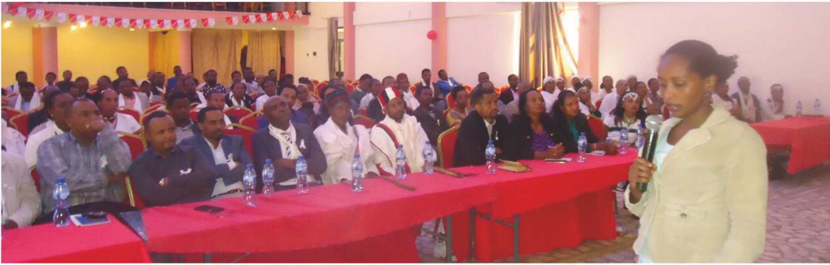
One of the study group members of Oromia Justice Bureau presenting the findings of the study.