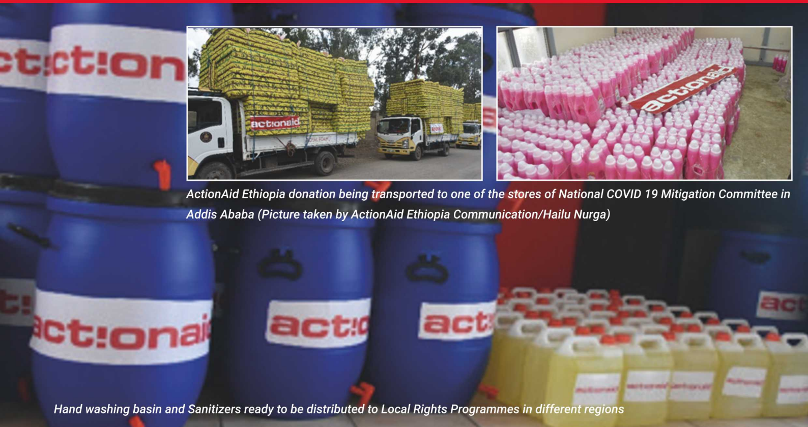
Hand washing basin and Sanitizers ready to be distributed to Local Rights Programmes in different regions