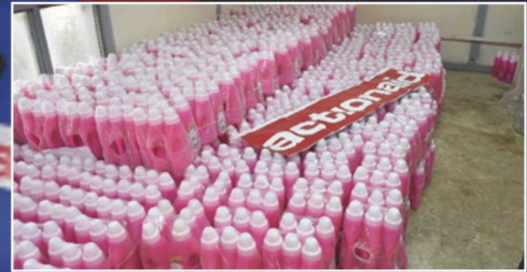
ActionAid Ethiopia donation being transported to one of the stores of National COVID 19 Mitigation Committee in Addis Ababa