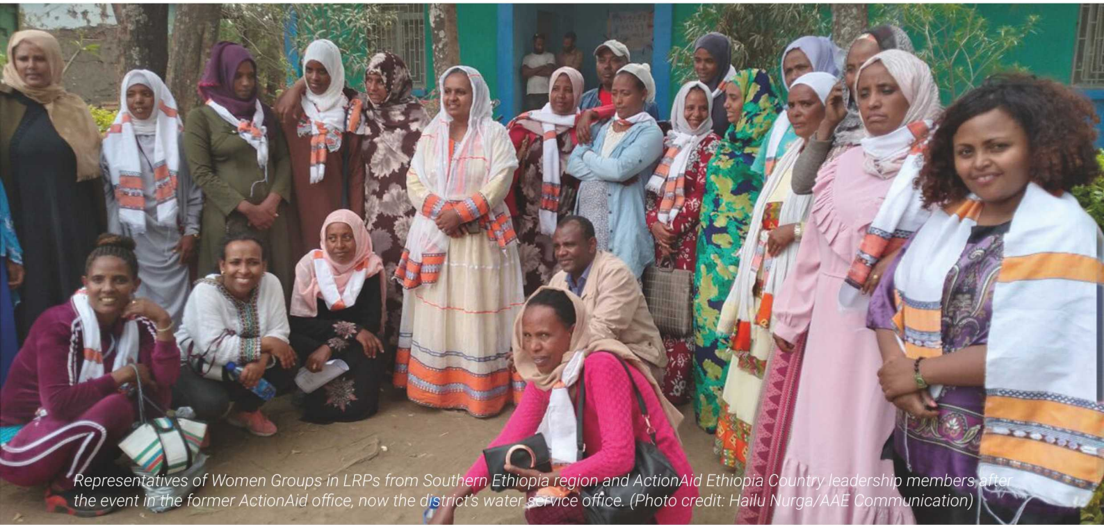
Representatives of Women Groups in LRPs from Southern Ethiopia region and ActionAid Ethiopia Country Leadership members after the event in the former ActionAid office, now the district's water service office.