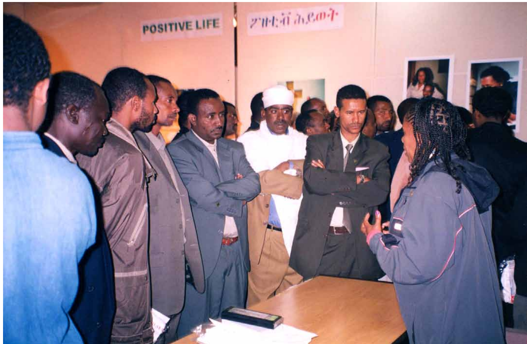
"Positive Lives" photograph exhibition (June - July 2004) was visited by about 50,000 people including higher government officials, international community, youth and other community members