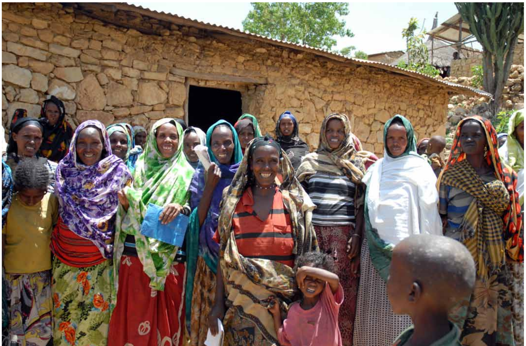
Members of an adult literacy group in Kombolcha CCDP