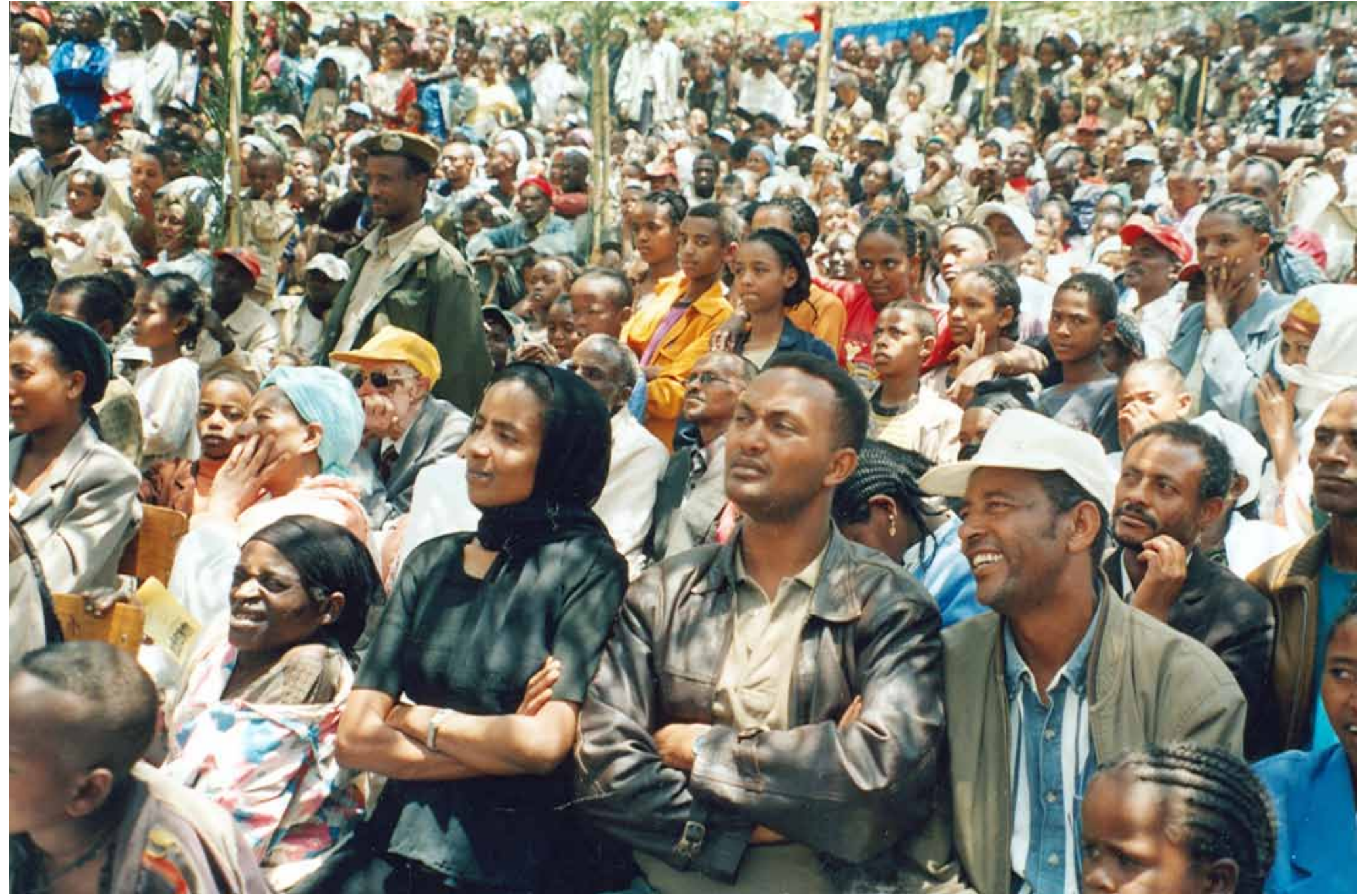
Dawro - Waka Social integration day organised by AAE (April 2004)