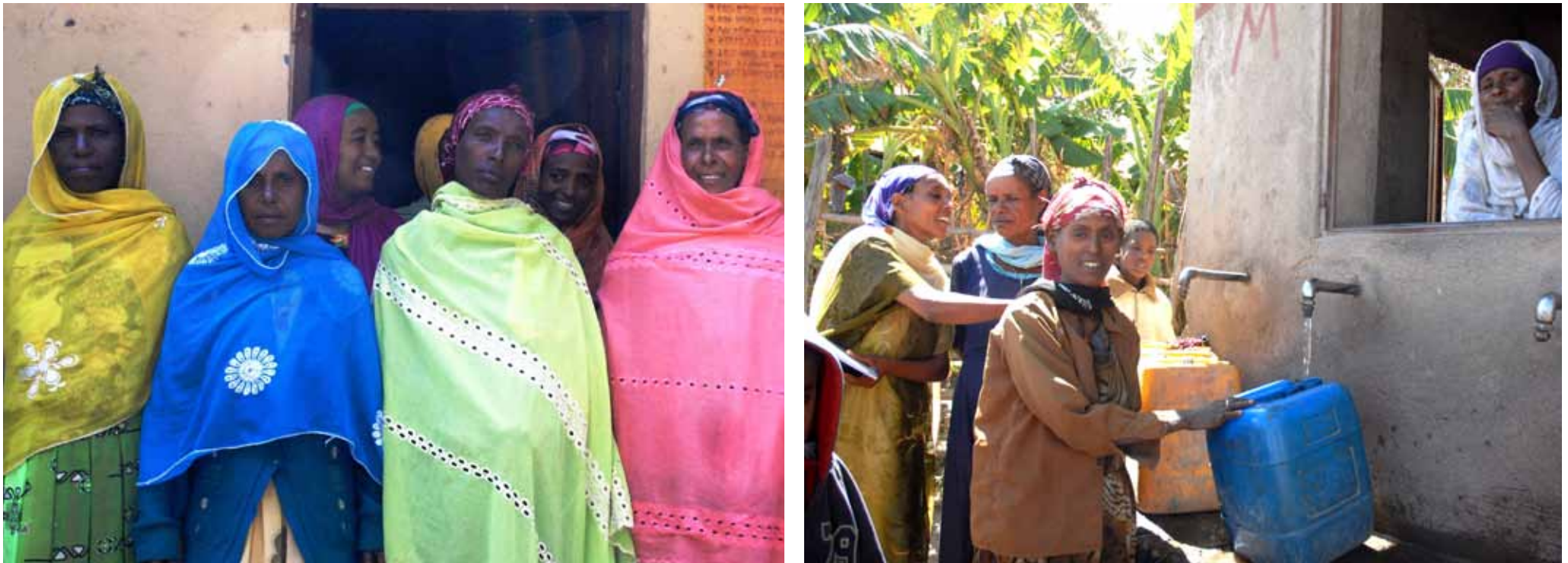
Current Board members of DAWWDA