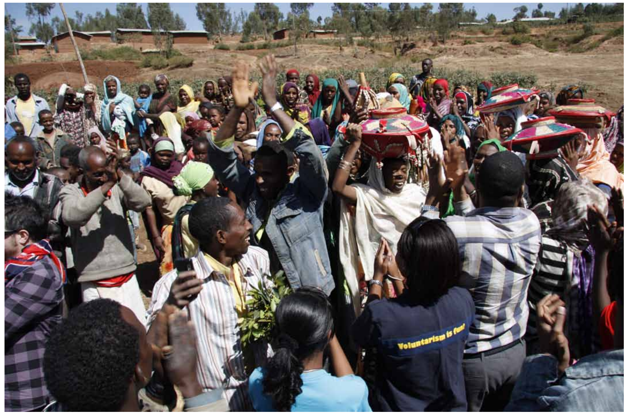
The Arsi Seru community celebrating the inauguration of the ActionAid-supported clean water service