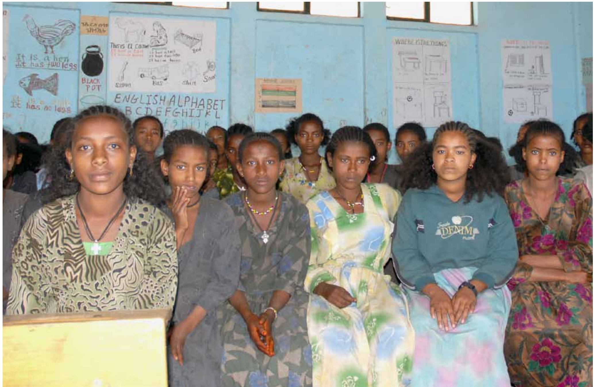
Some of the girls rescued from early marriage by the Women's Affairs Bureau of Ofla Woreda, Tigray and ActionAid (2007)