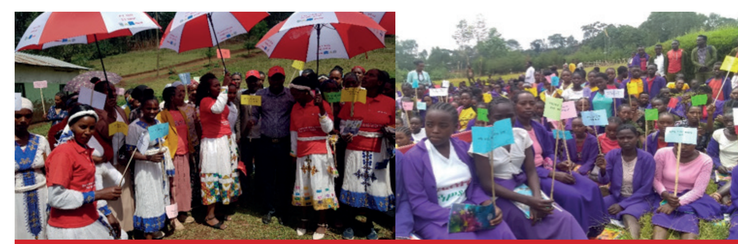
Women and students celebrating International Women's Day in their localities in Semen Bench, March 2022

March 2022, Mizan Aman that is one of the Local Right Program of ActionAid Ethiopia, International Women's Day is attractive when communities embrace it. It becomes more meaningful when women that have enlightened themselves about their rights and rejoiced its outcomes. Most importantly is serves as a venue for them to ask the duty bearer key policy issues