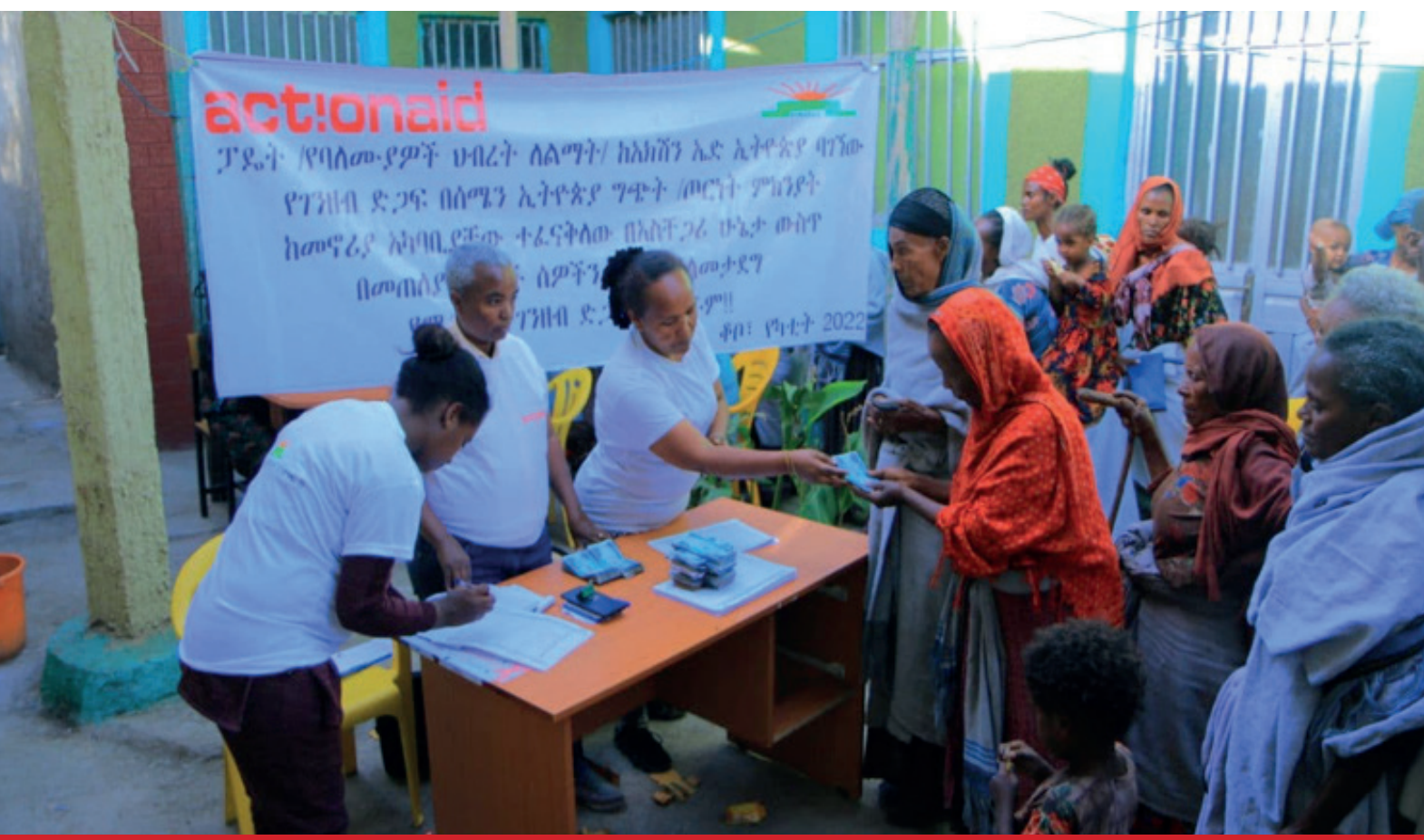
Distribution of the Multi-purpose cash to war-affected people in one of the IDP centres at Kobo primary school IDPs

January 2022, Ethiopia: Women and children are the hardest hit in natural and man-made calamities everywhere. Likewise, Northern Ethiopia's conflict is devastating the livelihood of millions. The armed conflict erupted in early November 2020 between the Tigray reginal forces and the federal government forcing hundreds of thousands to flee from their homes. The armed conflict was in Tigray for almost