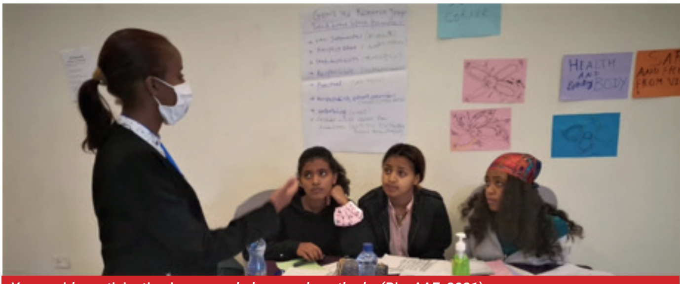
Young girls participating in women-led research methods, (Pic. AAE, 2021)

March 2022, Addis Ababa: The outbreak of COVID 19 has proved to be a good opportune for perpetrators. The scale of gender-based violence and care burden piled up on the mental and physical freedom of women and girls. This phenomenon was more visible in urban set ups like Addis Ababa.