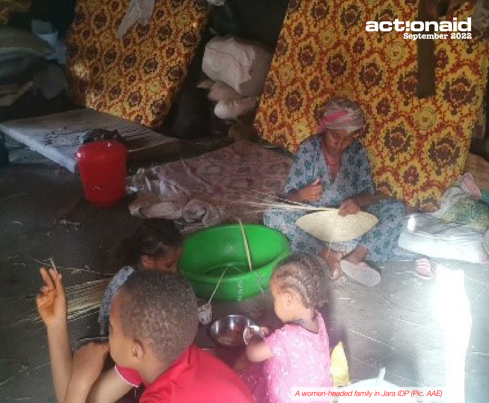
A women-headed family in Jara IDP