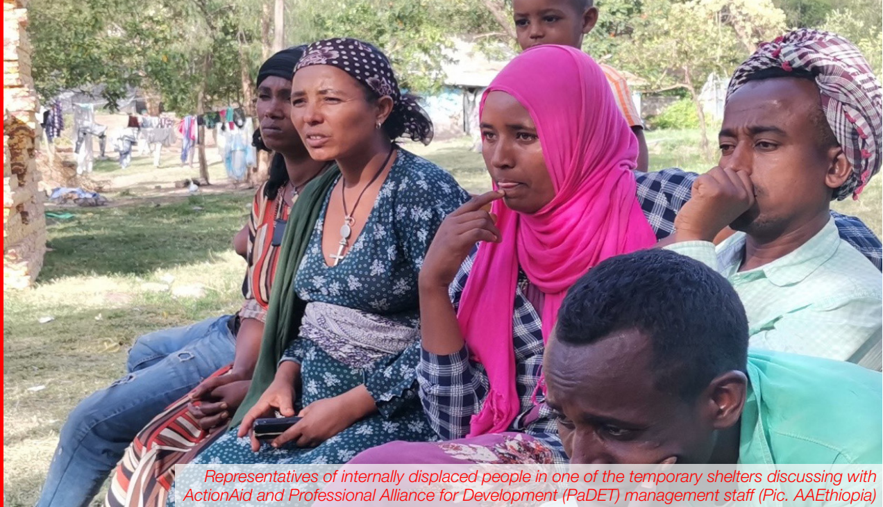
Representatives of internally displaced people in one of the temporary shelters discussing with ActionAid and Professional Alliance for Development (PaDET) management staff

- Northern Ethiopia Conflict Displaces thousands