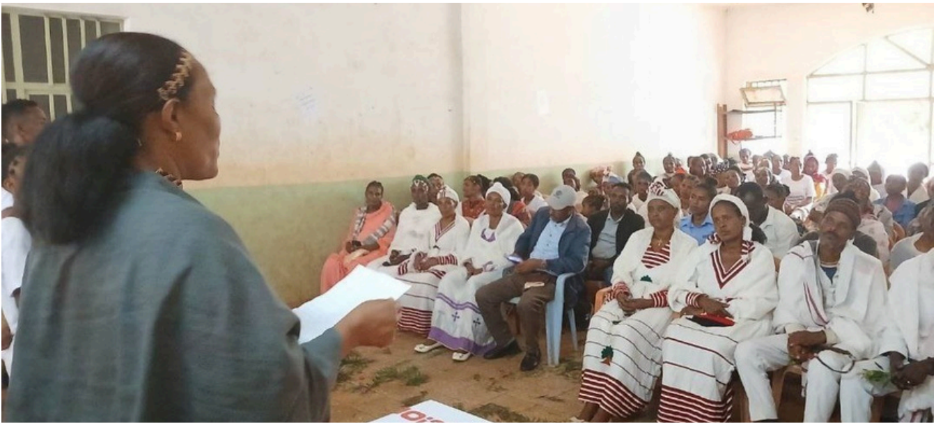
Your Participants actively engaged in the discussion, sharing experiences, challenges, and possible solutions to tackle GBV in the region. The IWD celebration at Ameya LRP successfully brought together diverse stakeholders to amplify the voices of women and demand urgent action against GBV.