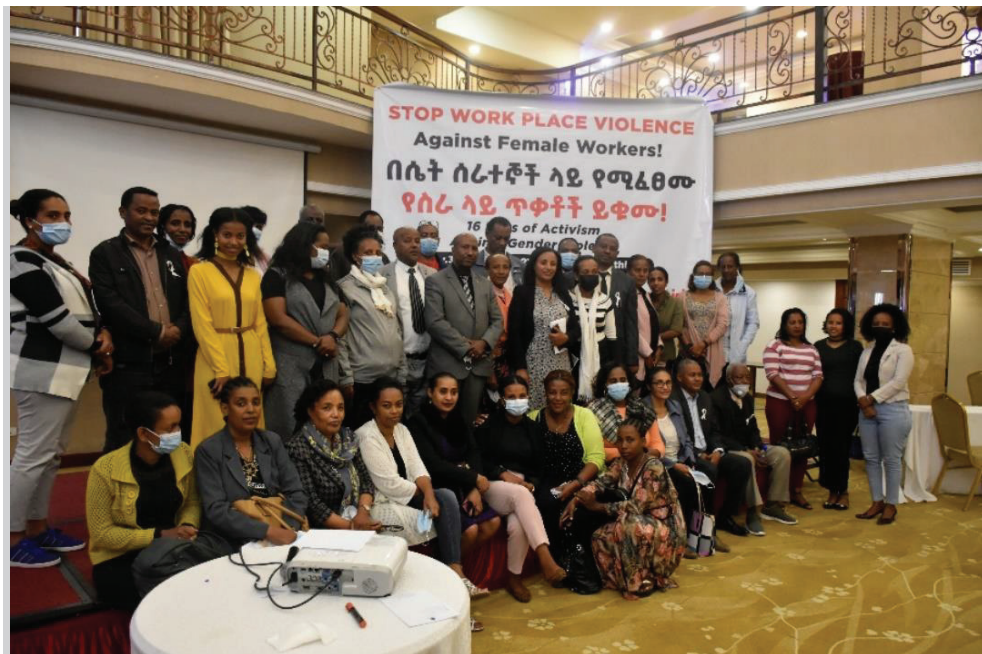
Participants of Advocacy and consultation workshop on stopping gender-based violence at

Despite the pledge made by the Ethiopian government to realize SDG (Sustainable Development Goals), one of which is Decent work and economic growth, it seems that many businesses are not aware of this right. Even worse, there are businesses that do not know the basic legal requirements stipulated by the national labor law. Research conducted by ActionAid Ethiopia (AAE) focusing on agri-business, large-scale industries, and service sectors revealed that business owners believe that the creation of opportunities