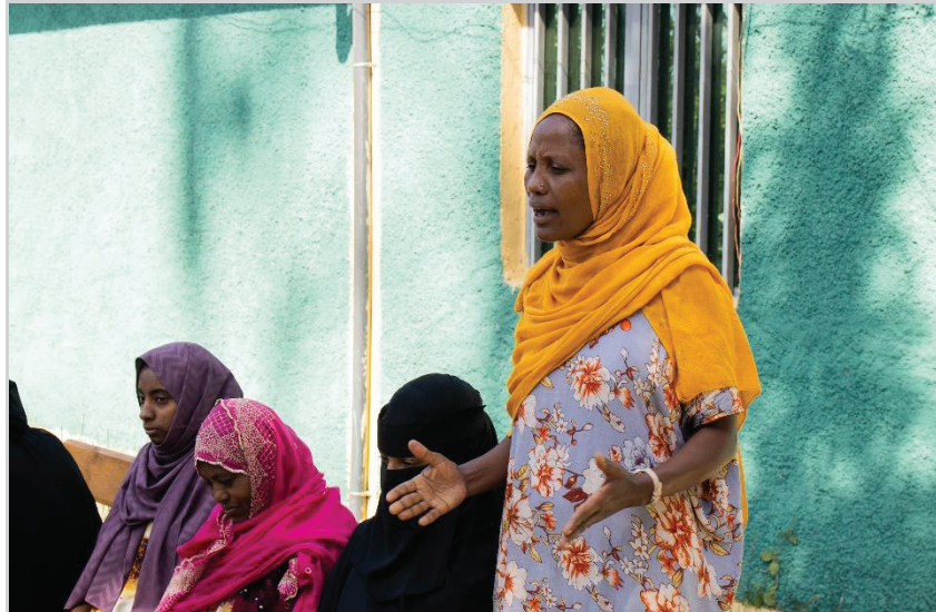
Returnees that are organized in groups in South Wollo discuss on their social and economic affairs while contributing their monthly saving.

namely: Emmanuel Development Association (EDA), People, Health, and Environment Ethiopia Consortium (PHE-EC), Consortium of Ethiopian Human Rights Organizations (CEHRO) and Union of Ethiopian Women and Children's Associations (UEWCA). Besides, there are three sub-grantees implementing this project: Ethiopian Human Rights Council (EHRC), Ethiopian Labor Rights Watch (ELRW), and Integrated Family Service Organization (IFSO). The project location areas are at national level (Addis Ababa), Amhara Region (South Wollo Zone, Harbu and Kutaber woredas) and SNNPRS (Hosana town and Soro woreda). The project aims to achieve the next three major outcomes: Governments have implemented measures to prevent, identify and address ECLAHT, and to protect and monitor vulnerable groups and victims of ECLAHT).